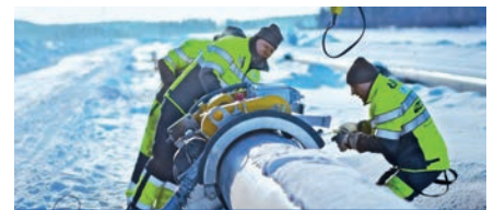
WEHOCOAT JOINT SYSTEM