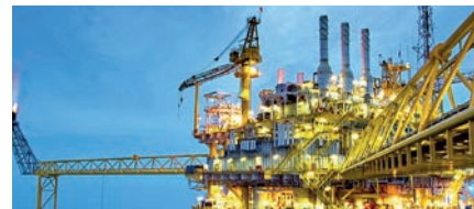
UNITED PIPELINES SERVICES AS